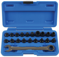
Low Profile Bit Set 1/4"D 20pc | 5914